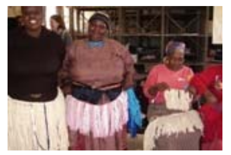
Adult support group members knit Zulu dance ceremonial skirts as part of their income-generating activities.

Looking ahead, staff and volunteers expressed a wide range of ideas on how they would like the organisation to evolve. These have been outlined below.