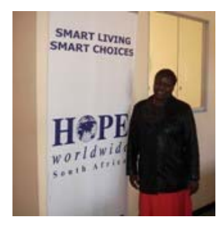
A staff member at Jabavu Clinic, refurbished with Rotary International assistance.